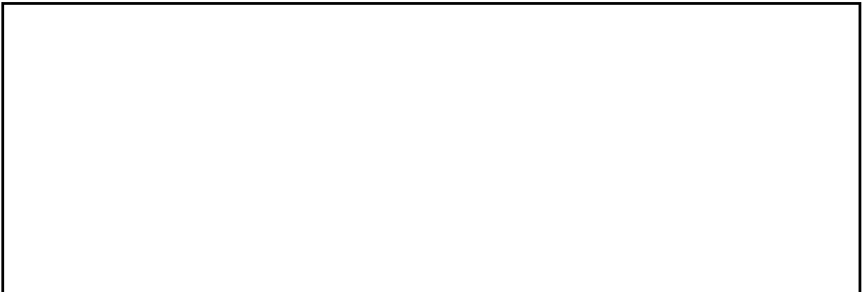
Figure 5 - Manufacturing, Use, and Open-Loop Recycling System