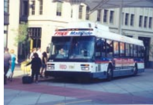
Passengers ride free on a hybrid-electric bus to Denver’s popular downtown mall.

The other five finalists were San Diego, Seattle, Portland, OR; Austin and Chicago. Each won top honors in a different category of metropolitan building design. San Diego’s energy plan, judged the best overall, focused on advanced technologies such as solar and fuel cells, clean transportation strategies, and plans to reduce