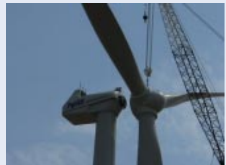
A propeller larger than the wingspan of a Boeing 747 is lifted by crane onto a wind turbine in Kimball, Nebraska.