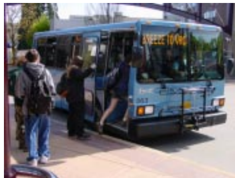
Students in Eugene, Oregon, "breeze" to class.

Because the buses are very quiet and emission-free, people find them a comfortable and pleasant form of transportation. Decorated with attention-grabbing artwork, they're often found in places where fun things are happening. Casual seating that wraps around the perimeter of the bus allows passengers to talk to each other and still enjoy the view out the window.