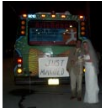
This bride and groom would rather take the bus.