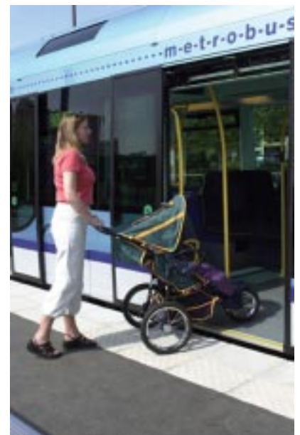
With no curbs or steps, the rail-like Civis bus offers easy platform boarding.

An array of new hybrid vehicles also caused excitement at Expo 2002. One of the most dramatic was a 60 ft.-long articulated bus manufactured by New Flyer, featuring the Allison parallel HybriDrive system. The bus was recently delivered to King County, Washington, which has put it into route service testing. The first bus of its kind ever built, the vehicle made its official debut on October 23rd in Seattle, with a big press event in the Seahawk Stadium.