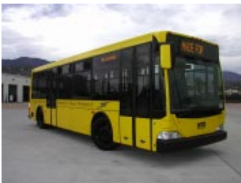
There are no unpleasant "jolts" aboard this "Stingray."

The upscale community of Santa Barbara, California has the most diversified fleet of electric buses in the United States, with five different types