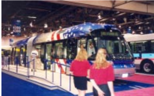
The Civis rapid transit bus, on display in Las Vegas, was awash in stars and stripes.

A futuristic Disney World-style monorail is now under construction in Las Vegas. The monorail will travel the resort corridor from downtown to the strip in 2004. City officials hope that it will take at least 4 million car trips off the city's roads each year, reducing traffic congestion and improving air quality. The speedy train is being built entirely with private funds and will connect eight resort hotels in four miles of the strip, from the MGM Grand on the south end to the Sahara in the north. From its lofty guideway, passengers will enjoy an unsurpassed view of the Las Vegas skyline. The monorail's sleek, bullet-shaped driverless cars will travel 50 miles per hour and will