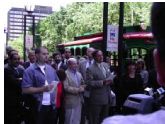
New Haven officials meet the press during dedication ceremonies of the electric trolley.

In Norfolk, Virginia, and Chattanooga, Tennessee, electric buses serve busy downtown circulator routes. In both cities, the shuttle is free to passengers. Norfolk's NET buses carry many of the city's work force between their offices and one of several outlying park & ride lots. Parking lot revenues help pay for the shuttle operation. Reflecting the flavor of Norfolk, which lies on the Chesapeake Bay, each NET bus is painted a deep aqua blue and adorned with the city's mermaid motif.