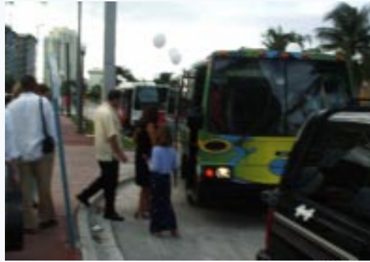
Wedding guests ride pollution-free on the electric shuttle.

The couple had always enjoyed taking the shuttle on dates in South Beach, she added. They like the different artistic designs on the buses and the idea of riding an all-electric, environmentally clean bus.