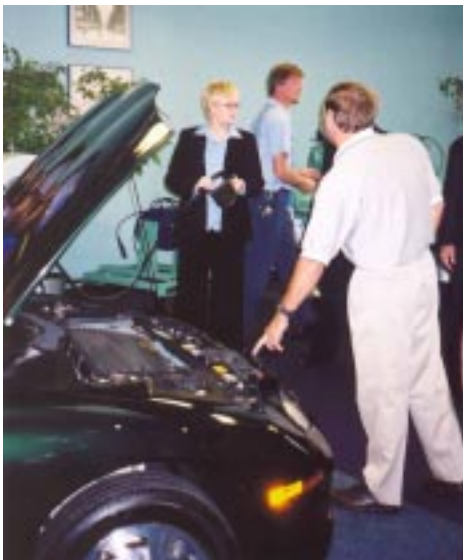
The EV1 is charged from an opening in the car's front grille.

"We're proud to display this unique electric EV1 car," said Tom Dugan