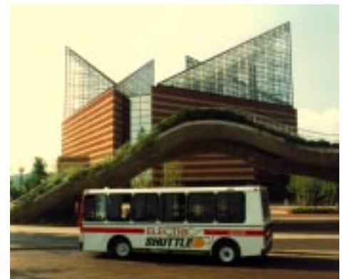
The electric shuttle stops at Chattanooga’s top attraction, the Tennessee Aquarium.

The international competition will stimulate new thought and practices that will result in more livable cities for the next 100 years. San Diego will join Buenos Aires, Argentina; Vancouver, Canada; Changshu, China; Berlin, Germany; Goa, India; Tokyo and Mishima, Japan; and Vologda, Russia at the awards competition in Tokyo.