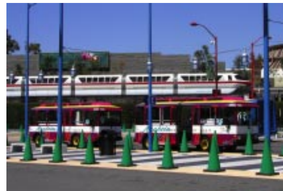
In Anaheim, a trolley-style electric shuttle operates alongside the Disneyland tram.

In California, electric buses can be found on the streets of Visalia, Santa Clara and Anaheim. Anaheim's trolley-style buses pick up hotel guests and shuttle them to Disneyland and back. Visalia decided to go electric when it made the American Lung Association's top 10 most-polluted cities list. Santa Clara operates three large hybrid-electric buses that serve as a commuter shuttle.