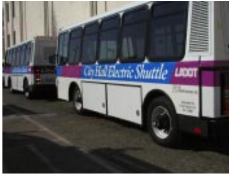
LADWP's city hall electric shuttle.

of vehicles. Santa Barbara's transit authority has decided to purchase 20 large electric buses to replace its regular diesel buses in route service, and has started operating a new state-of-the-art charging facility. One of the most innovative vehicles in the fleet is a bright yellow 30-foot pure electric bus called the Stingray. It has an impressive range of 130 miles (or 160 miles with rapid charging).