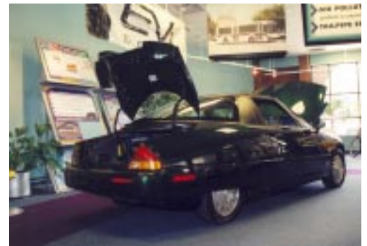
An EV1 is displayed at the Electric Vehicle Information Center.

Since 1997, General Motors has leased hundreds of its sporty, nonpolluting EV1s to environmental and technology enthusiasts in California and Arizona. Although it no longer manufactures the car, GM says it is applying lessons learned from the project to develop fuel cell cars for the future. ■