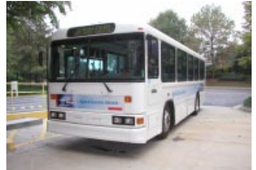
A Bluebird bus with the SKI hybrid propulsion system goes through its paces at Georgia Power.

motor costs much less than specially built motors, using robust off-the-shelf components that can be readily replaced when needed.