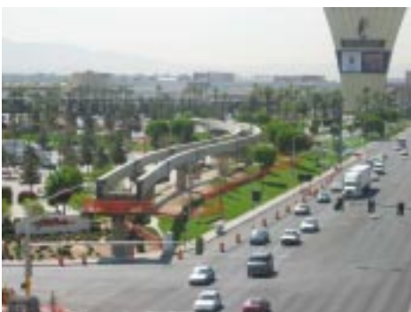
The Las Vegas monorail will take visitors sky-high in 2003.

New hybrid vehicles were also presented at the expo by Advanced Vehicle Systems, Ebus, Gillig, MCI and other manufacturers.