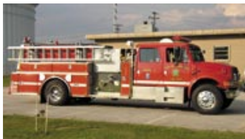
Fire Engine #3 is now using B20. This is a big first step for East Tennessee, and Maryville is taking that step.