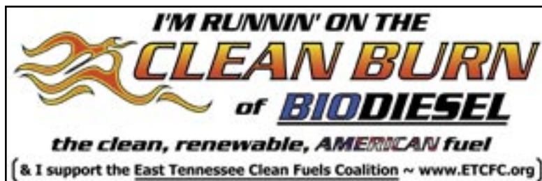
This is the signage that the Biodiesel Brigade partners are displaying on their vehicles.

If anyone is interested in becoming a partner for a cleaner community and supporting the use of a renewable fuel, and is already or beginning to fill their