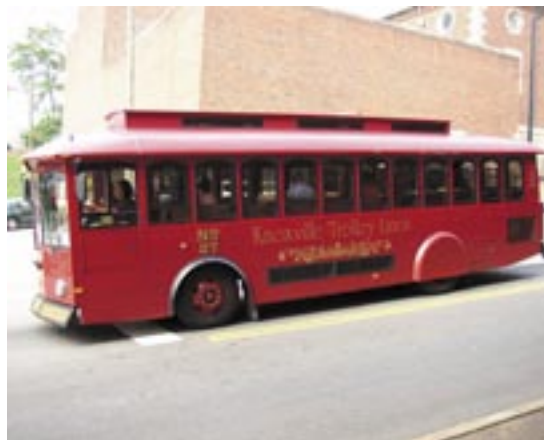
This is one of KAT's trolleys that operates around the downtown Knoxville area. All of the diesel trolleys, and another 70 diesel KAT vehicles, are now running on B20. KAT has recently received national accolades for their hard work on improving their transit system on all fronts.