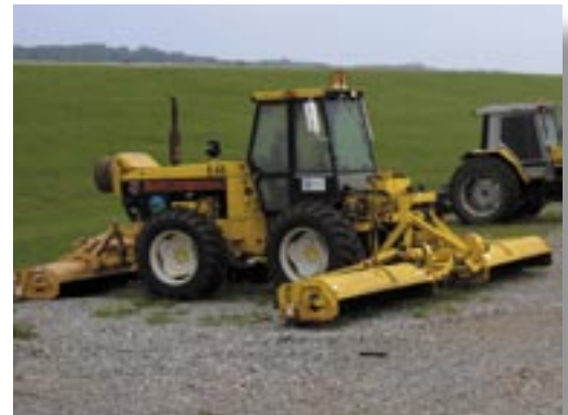
One of the tractors that Metropolitan Knoxville Airport Authority is testing a biodiesel blend in.

The project works from looking at today's airports, which are in many respects inefficient and costly to operate, to a simplified system that uses more automation. The project includes possible hybridization of airplanes, too.