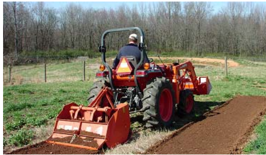
Crabtree Farms Kubota tractor that is running on B50.

Another group with buses (in addition to the Staffords that operate 8 school buses on B20 for Hamilton county), McCallie School has begun using B20 in their 13 pieces of equipment (mostly buses)