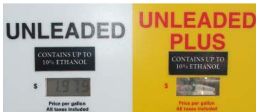
An example of the signage that Pilot placed on local pumps that are offering the ethanol blend.

With a history of working to put ethanol into use in the East Tennessee community, Pilot Corporation recently began offering E-10 at 34 of its Knoxville area locations.