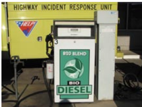
(l-r) The decal on the TDOT pump at the Knoxville refueling site and one of the bumper stickers that TDOT uses to raise awareness of their biodiesel usage.