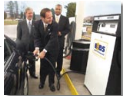
Tennessee Congressman Zach Wamp pumps the first gallon of E85 into one of the flex-fuel vehicles operated by the Department of Energy at the Oak Ridge Operations Office during the station's grand opening in 2003.

It is absolutely vital that the government and private sector work together in ways that bring about practical, useful solutions. I urge you to learn more about biofuels and get involved to benefit our future and make our country more energy independent.