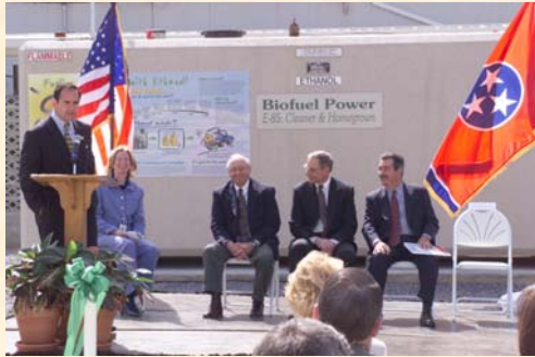
OAK RIDGE NATIONAL LABORATORY U. S. DEPARTMENT OF ENERGY