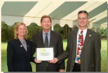
OAK RIDGE NATIONAL LABORATORY U. S. DEPARTMENT OF ENERGY